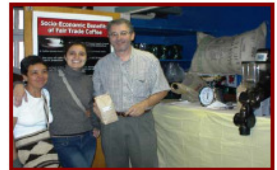
Fair Trade Coffee is sipped and sold after service.

Wellington is a vibrant community, housing the award winning "Timeline Theatre", and a childcare center sponsored by the Heartland Alliance. In addition, we host a monthly progressive film series called the "Conscientious Projector" that focuses on action around a diverse number of social justice issues.